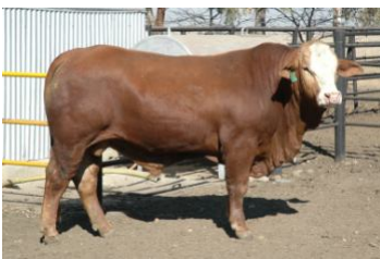
Zamugo Zidaan AZ0671B