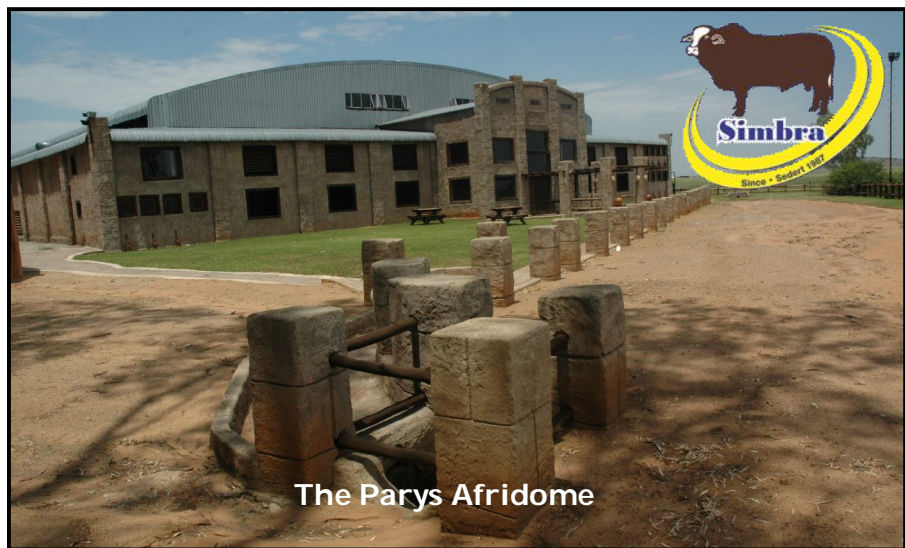
The Parys Afridome

Excelsus Landgoed would like to extend a warm invitation to all our International fellow Simbra breeders and fanciers to join us for a week of Simbra festivities to celebrate twenty five years of Simbra in Southern Africa.